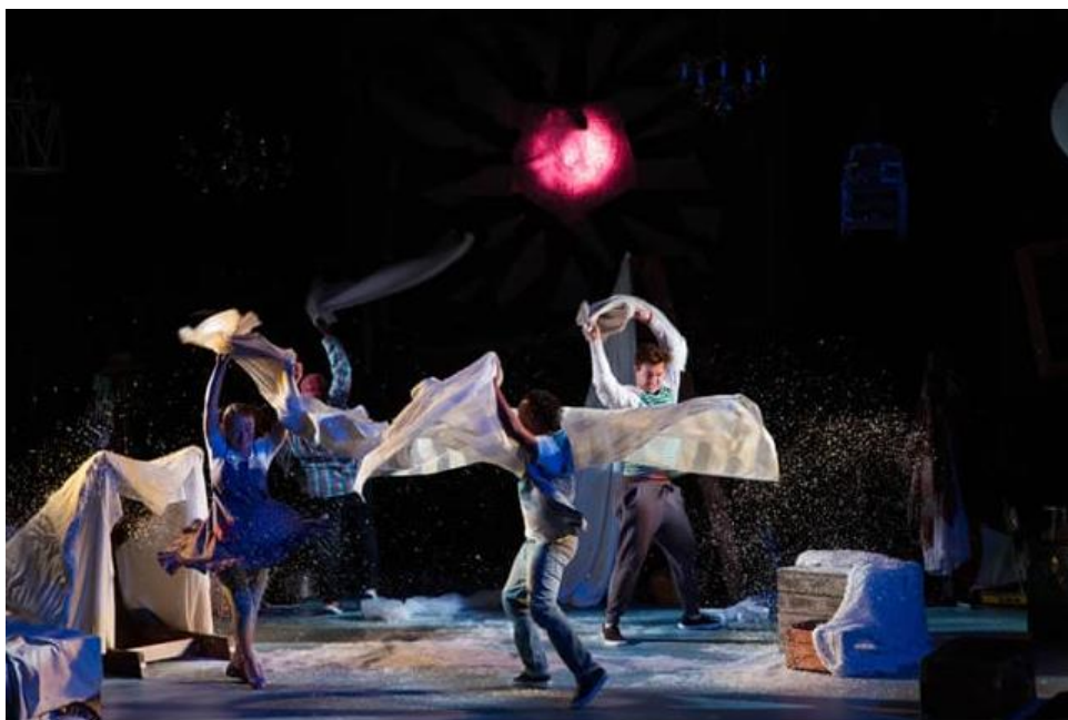
The cast of The Snow Queen from Imagination Stage

The ensemble is adept at physical comedy, each have expressive faces, and all stay completely connected to the nature of the story. Each embodies the wide-eyed innocence of young children while balancing the comic and dramatic aspects of the play adroitly. With the cast members' energies practically leaping through my laptop screen, I can easily imagine how well this play would fill up Imagination's stage.