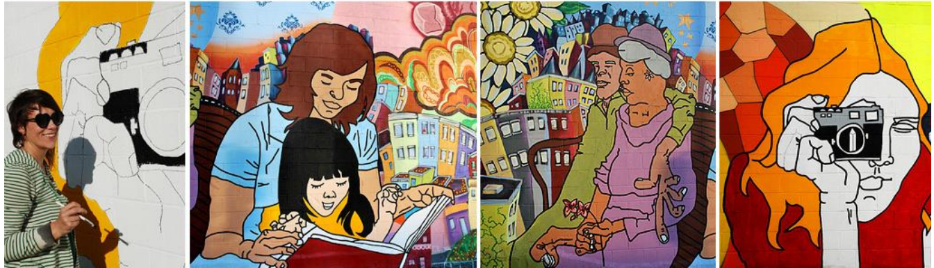
Collaborative mural celebrating seasons in Washington, DC. Sponsored by DC Commission on the Arts and Humanities